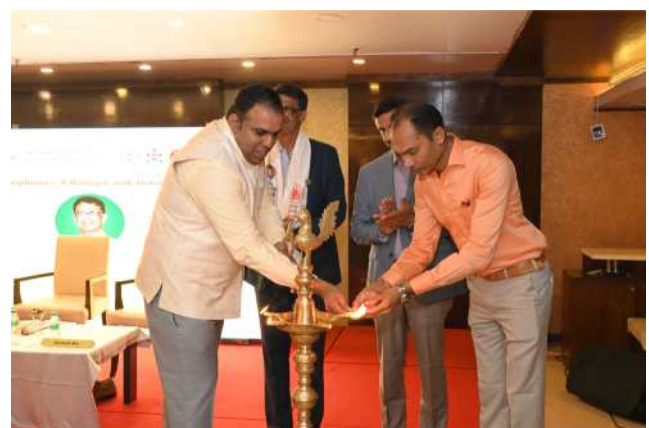
Lighting the lamp by Chief Guests, Speakers and NIPM executive committee members